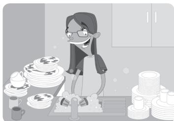
a. wash / do the dishes